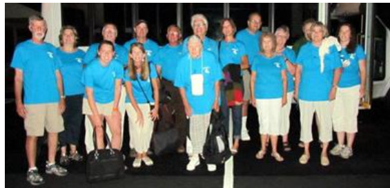
Belize Mission Team