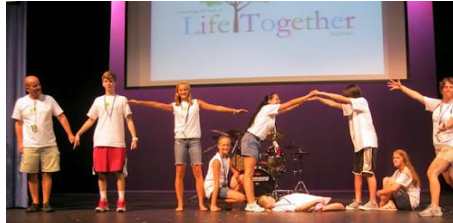
Bland Mission Team